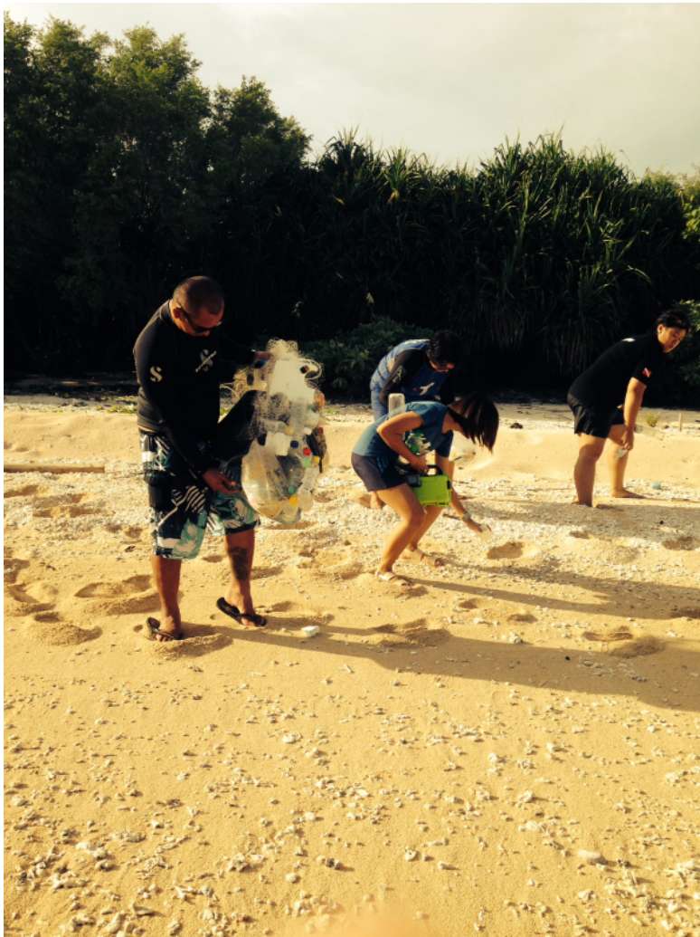
Beach clean-up in Apo Reef Natural Park Grounds

Manila, Philippines – Second week of August 2015, the Philippine Commission on Sports SCUBA Diving (PCSSD) with the support and cooperation of the Tubbataha Management Office (TMO), completed Phase 1 of Mooring Buoy Installation Project in Apo Reef Natural Park (ARNP) – Mooring Site Inspection and Evaluation Phase. This conservation initiative of the PCSSD required coordination with the TMO for their expertise and prior experience in installing mooring systems in Tubbataha Reefs Natural Park (TRNP) which is also considered as ARNP's 'big sister marine park'. The first order of business was the inspection of proposed mooring sites to check the kind of substrate/seabed in each of the proposed mooring sites. After then, it identified the most appropriate kind of mooring buoy system that is most effective in each of the proposed sites.