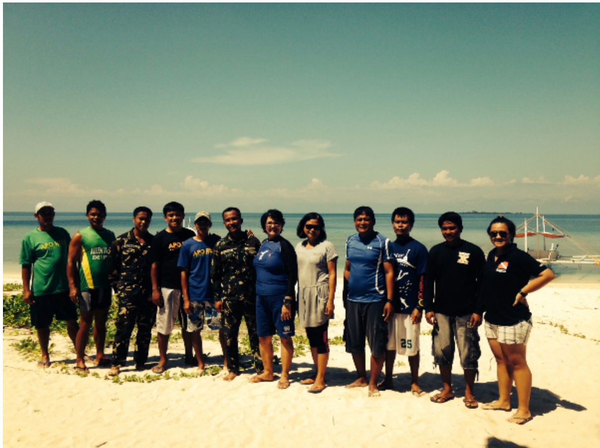
Group picture - Apo Reef Rangers from the DENR, Sablayan LGU, and Army with