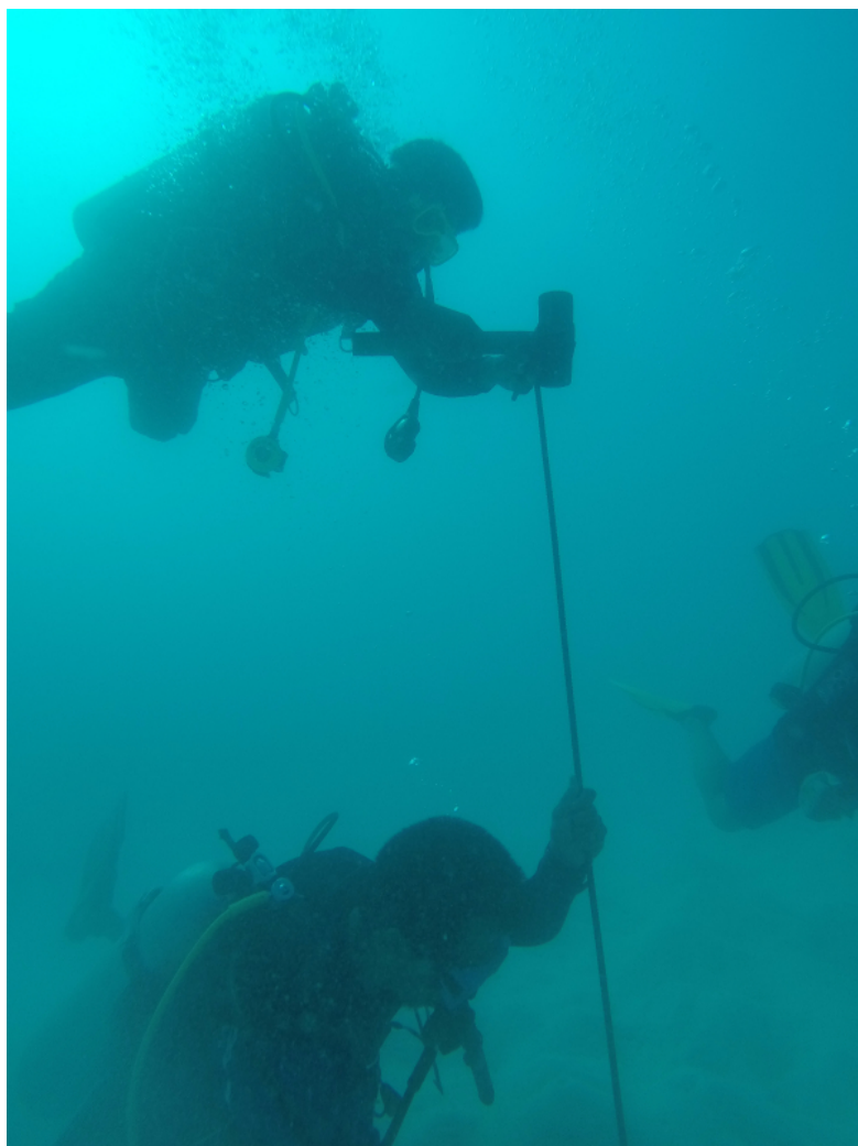
8-foot probe while Ranger Odel of the Apo Reef Protected Area Office holding it firmly)