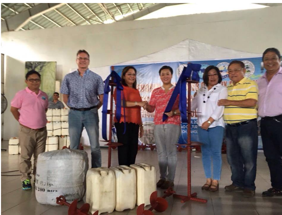
Ceremonial Turn over of the Helix Mooring System from PCSSD to LGU Panglao/PADO and all the dive stakeholders who are accountable for the sustainable use of Balicasag Island.